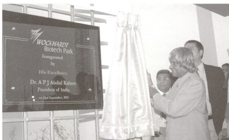
President of India inaugurates Wockhardt Biotech Park in Aurangabad.